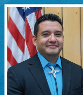
MAYOR Pascual Maestas Town of Taos Alternate TBD