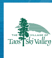
TBD Village of Taos Ski Valley Alternate Jalmar Bowen Building Inspector