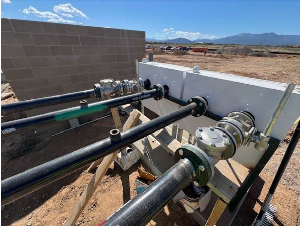
Fuel Supply Piping