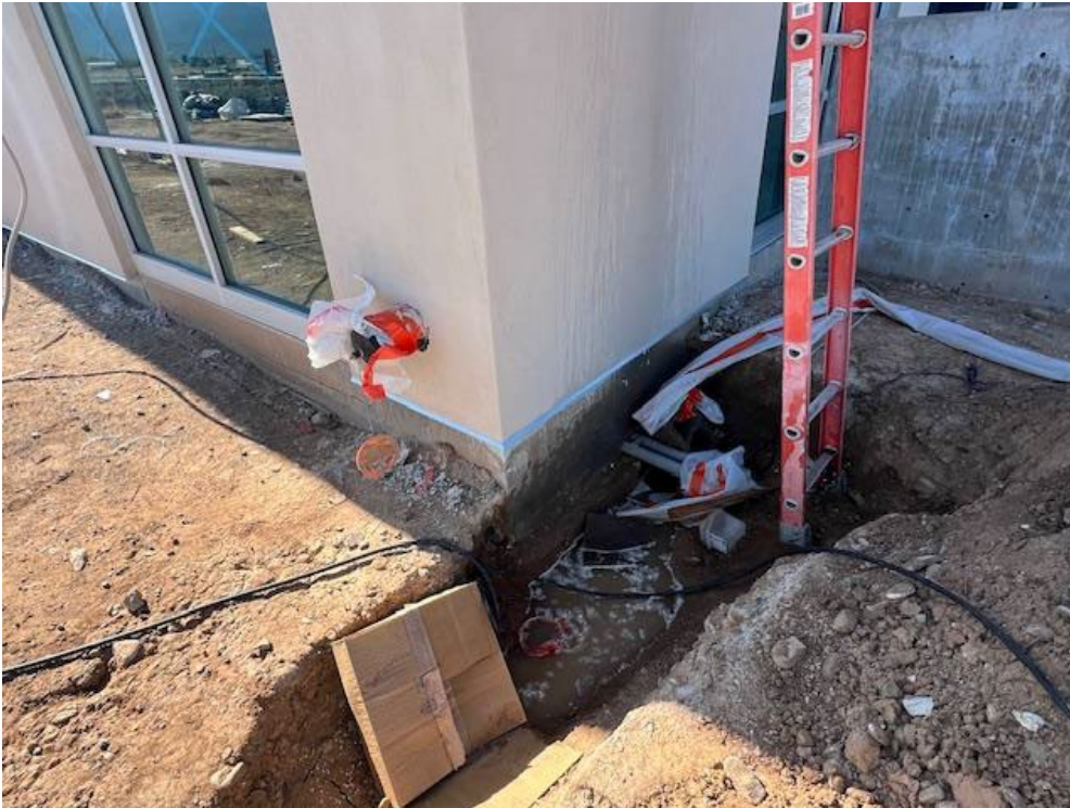
Overflow Drain Installation