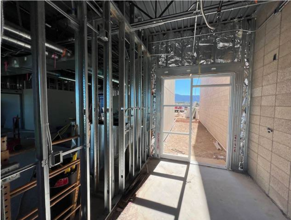
Aluminum Storefront Framing