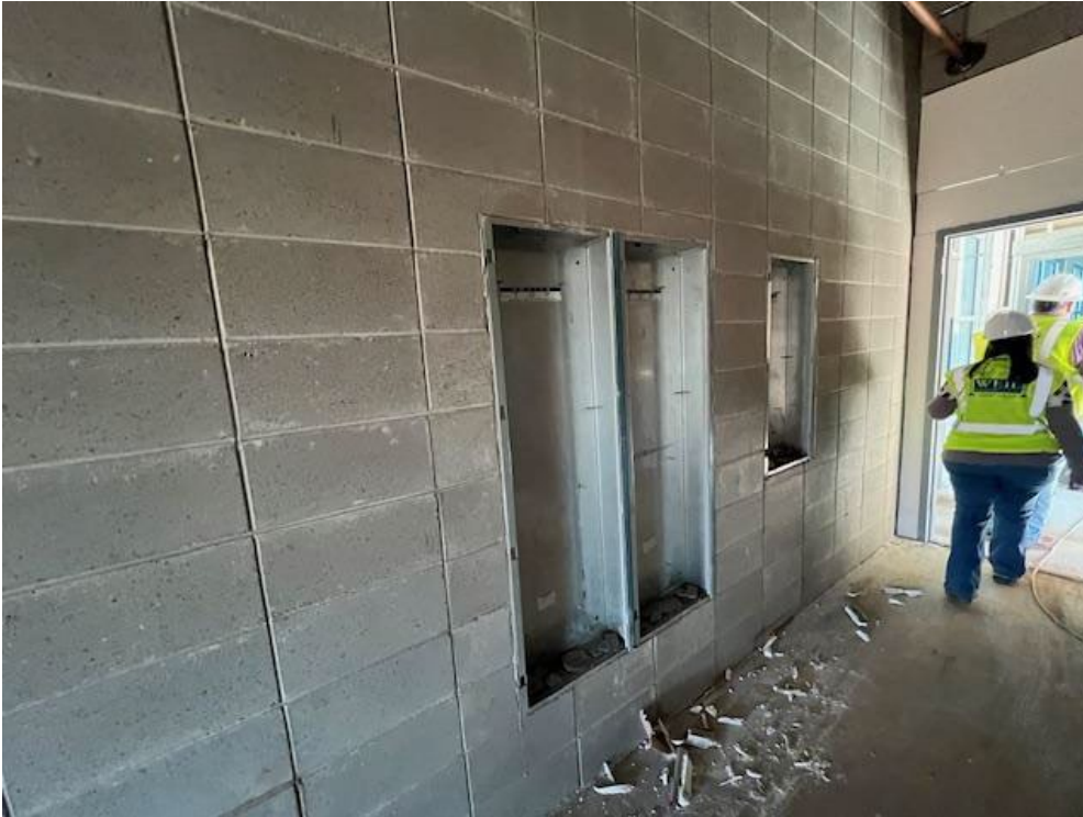
Circuit Breaker Boxes