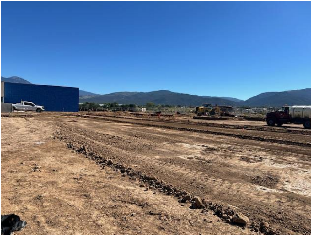
Grading along Salazar Rd Entry