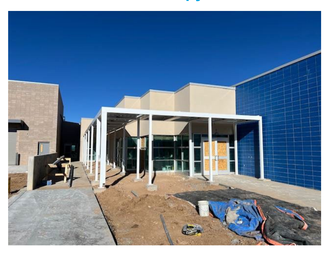
Sidewalk and Canopy Structure