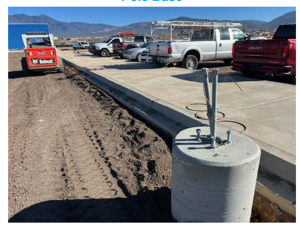
Concrete Curb, Gutter and Sidewalk, Light Pole Base