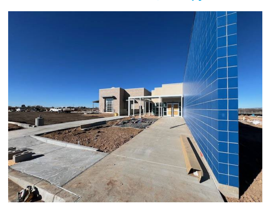
Concrete Curb and Sidewalk, Canopy Structure