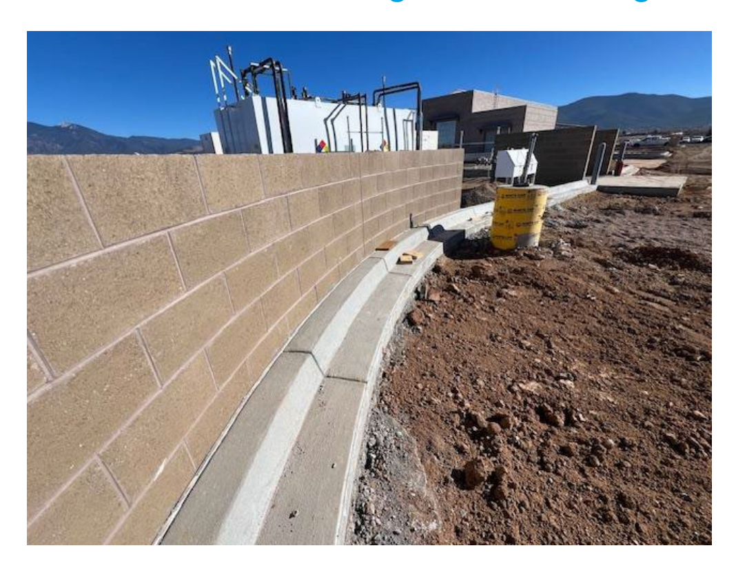
Curb and Gutter at Fueling Island Retaining Wall