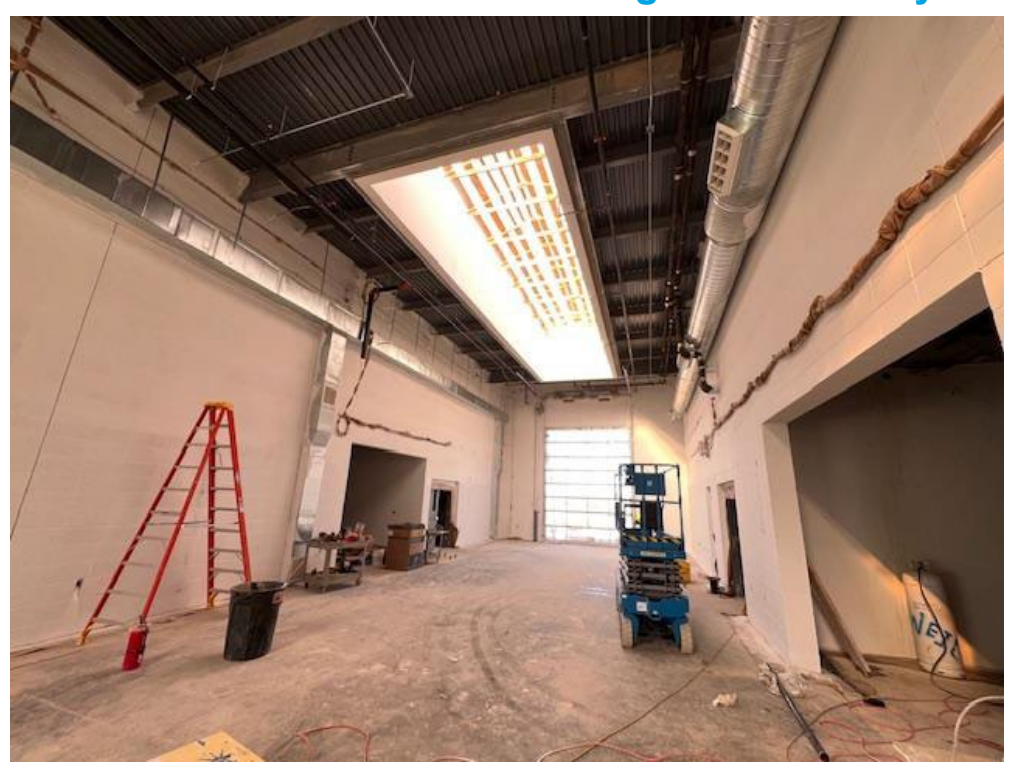
Paint, Fire Suppression System and Mechanical/Electrical/Plumbing in Service Bay