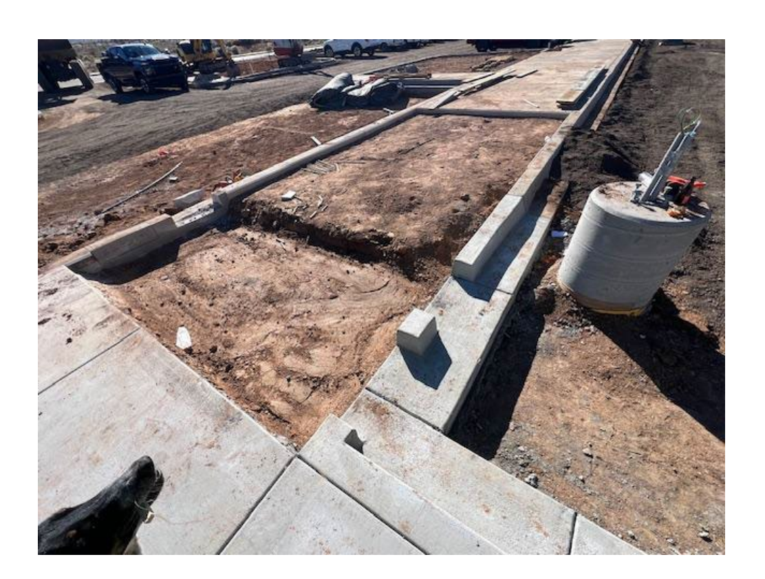
Curb and Concrete Pad